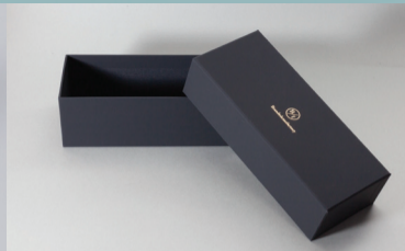
LID+BASE PAPERBOX -