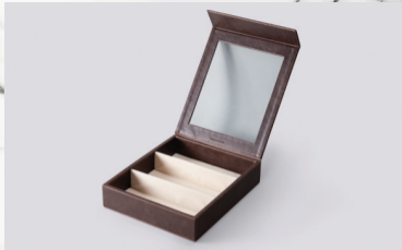
DISPLAY BOX 3 w/window