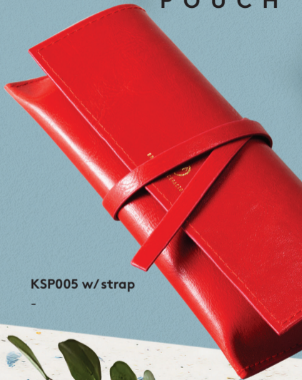
KSP005 w/ strap