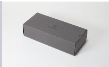
SELF MOUNT PAPERBOX -