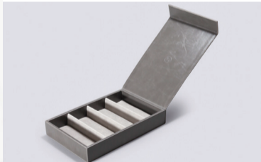
DISPLAY BOX 4