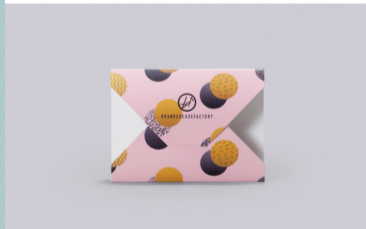
MINI PAPER SLEEVE for Lens Cloth -