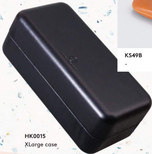
HK0015 XLarge case