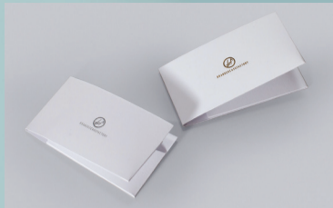
MINI PAPER FOLDER For card and lens cleaner pack